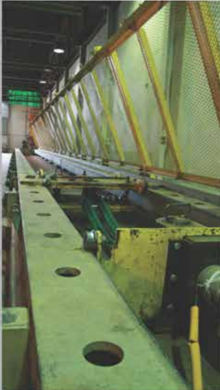
100' long Lloyd's Approved Test Bed