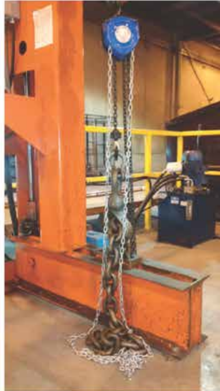
CM 40,800 lb Capacity Hoist Test Stand