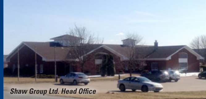
Shaw Group Ltd. Head Office