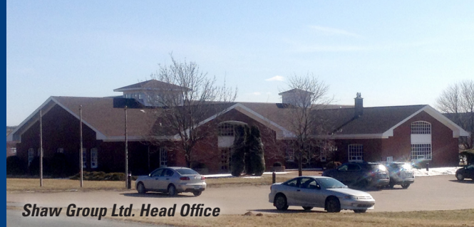
Shaw Group Ltd. Head Office